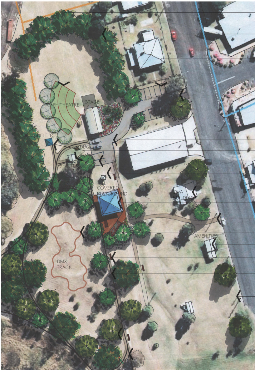
LANDSCAPE CONCEPT SKETCH SCALE = 1:500 @ A1